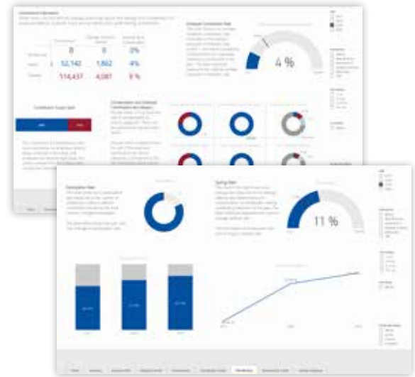
Plan Sponsor Dashboard

Information is a critical resource for advisors, TPAs and the Plan Sponsors they serve. Through our proprietary Plan Intelligence Reports, users are presented with a wealth of information about their plans broken down by key demographics. Our interactive dashboard allows users to find important information quickly and easily.